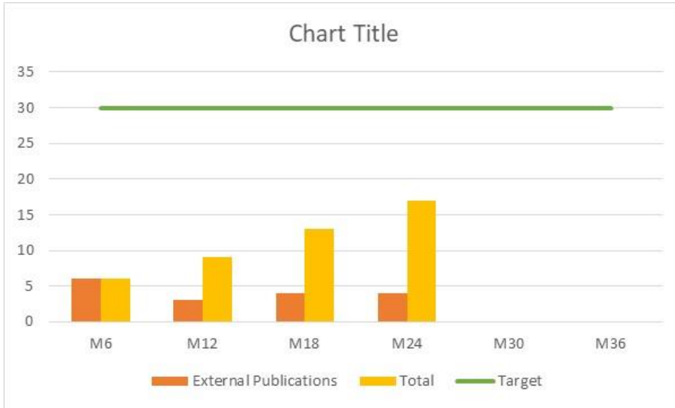
Figure 1 – Number of External Publications Chart