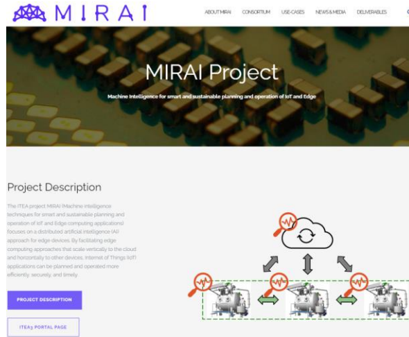
Figure 3-3 - MIRAI Webpage - Frontpage