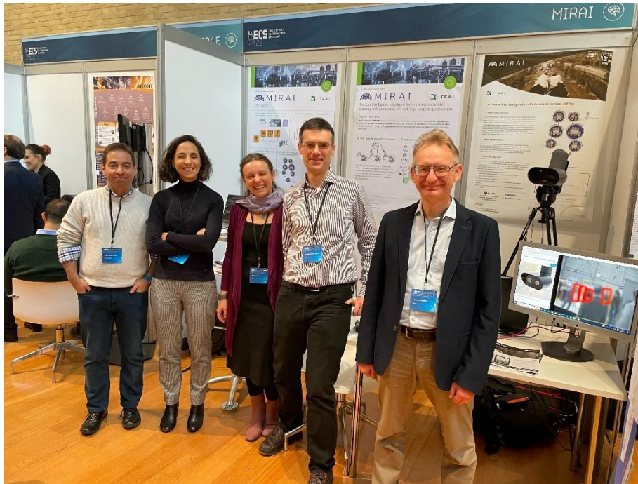
Figure 3-1 - Selected event: the MIRAI team at EFECs 2022.