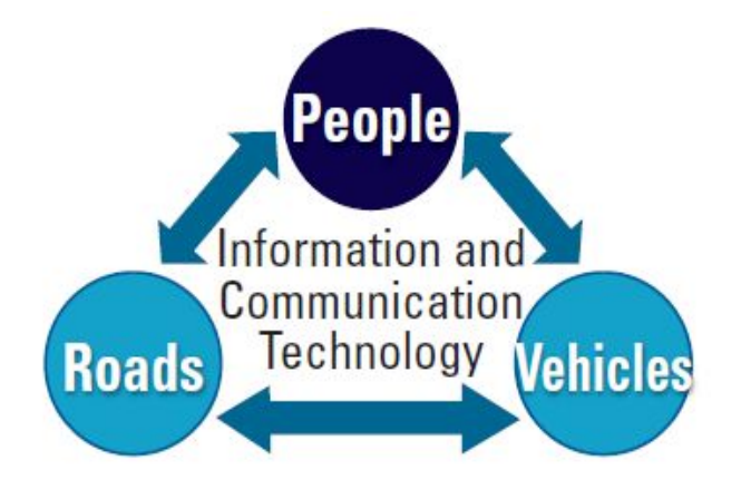
Figure 1 : ITS [1.54]

The Ministry of Land, Infrastructure, Transport and Tourism of Japan defines an ITS as a new transport system constructed with a goal of alleviating road traffic problems such as accidents and congestion using state-of-the-art information and communication technologies to create an information network based on people, automobiles, and roads [1.54].