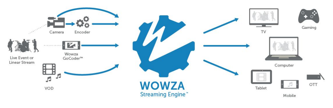
Figure 6: Wowza [2.24]

Wowza Streaming Engine is a combined streaming media server software." Servers used for live and on-demand video streaming, desktop, laptop and tablet computers, mobile devices, IPTV set-top boxes, Internet-connected TVs, game sounds and rich Internet applications over IP networks for consoles, and other networked devices. [2.21]" A Java application servers can be deployed on multiple operating systems.