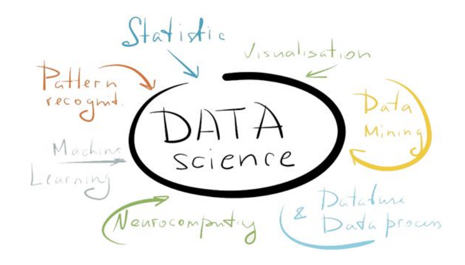
Figure 2 : Data Science [2.5]

either structured or unstructured, which is a continuation of some of the data analysis fields such as, programming, statistics, data mining, and predictive analytics [2.4]". Data science is a general concept including MIS at the most abstract level to the prediction algorithms at the lowest level.