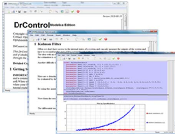
Fig 2. The active electronic notebook, DrControl