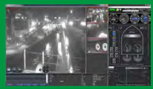
Figure 2 Sensor interface and smart maritime surveillance system GMT pilot

The pilot includes integrating various sensors on a passenger ship (e.g., for ballast water tank,