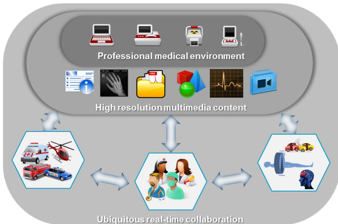
Caption: MEDUSA virtual collaborative environment: an integrated and interoperable set of tools to unlock medical information and functionalities.