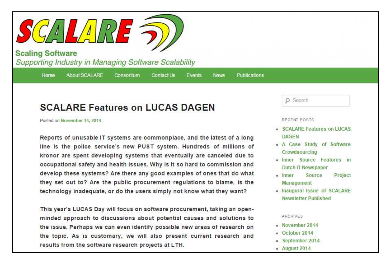
Figure 1. SCALARE website look & feel

The SCALARE website consists of a number of sections. Within each section, all pages follow a similar layout. An example is shown in Fig. 1.