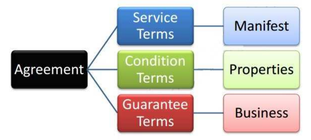
Figure 2: Structure of ACCORDS Service level agreement

The CORDS specification aims at providing a service level agreement description and management model for Cloud services. The different constituent elements of an Agreement, as described by the WS-Agreement specification, have consequently been adapted for discrete and distributed operation as OCCI [3] category instances. The following diagram gives an overview of the structure of an Agreement.