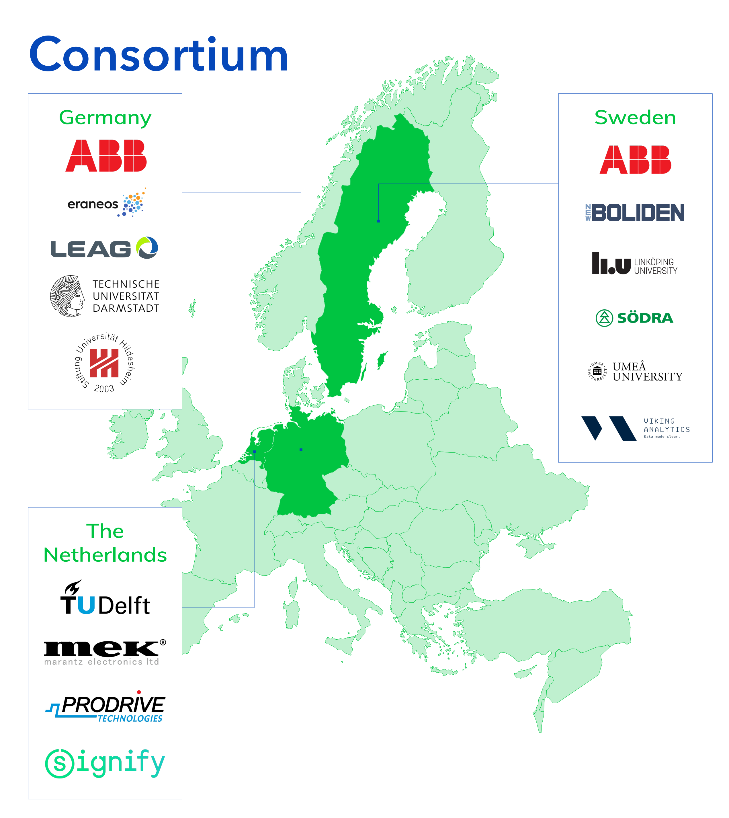
EXPLAIN project website

EXPLAIN (EXPLanatory interactive Artificial intelligence for INdustry) will create an end-to-end machine learning (ML) lifecycle for industrial domain experts that provides human supervision on artificial intelligence (AI) systems and ML models. This will increase the acceptance of AI/ML in industrial settings.