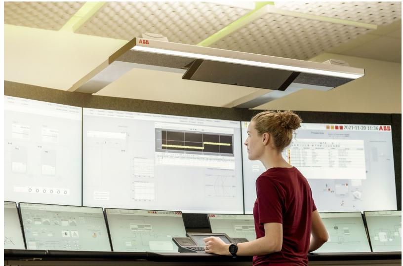
Control room operator troubleshooting an issue in a utility plant

high safety requirements), allowing them to optimise their processes with AI/ML for the first time. In the process industry, for instance, 80% of the USD 20 billion in annual losses is estimated to be preventable. The estimated market access of new products and services from the consortium are expected to boost a turnover of EUR 500 million by 2026; they will also be able to position themselves competitively in the emerging global XAI market, predicted to grow by 18.4% annually to USD 21 billion in 2030.