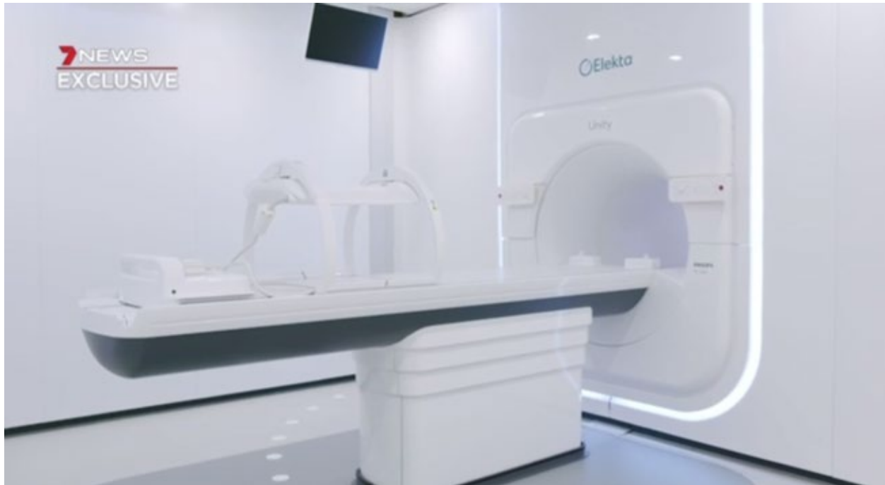
The Elekta Unity MR Linac machine.

The former principal is one of 20,000 people diagnosed with prostate cancer every year.