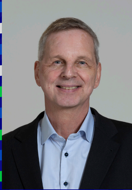
^ Wilbert Schaap Dutch Ministry of Economic Affairs and Climate policy