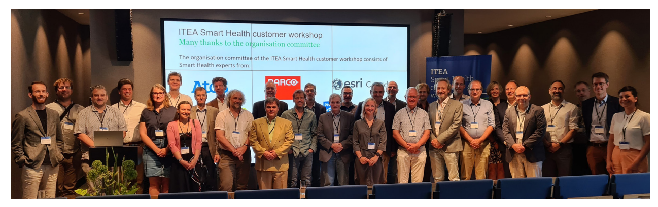
ITEA Smart Health customer workshop participants

In addition to the emergence of these solid ideas and some collaborations, the workshop has helped to progress towards a shared vision of the research priorities to address the important transformation underway in the Smart Health sector. The participants have developed new connections that will be important as no single player can tackle the current challenges alone. In conclusion, this workshop was very valuable in fostering ITEA activity in the healthcare sector.